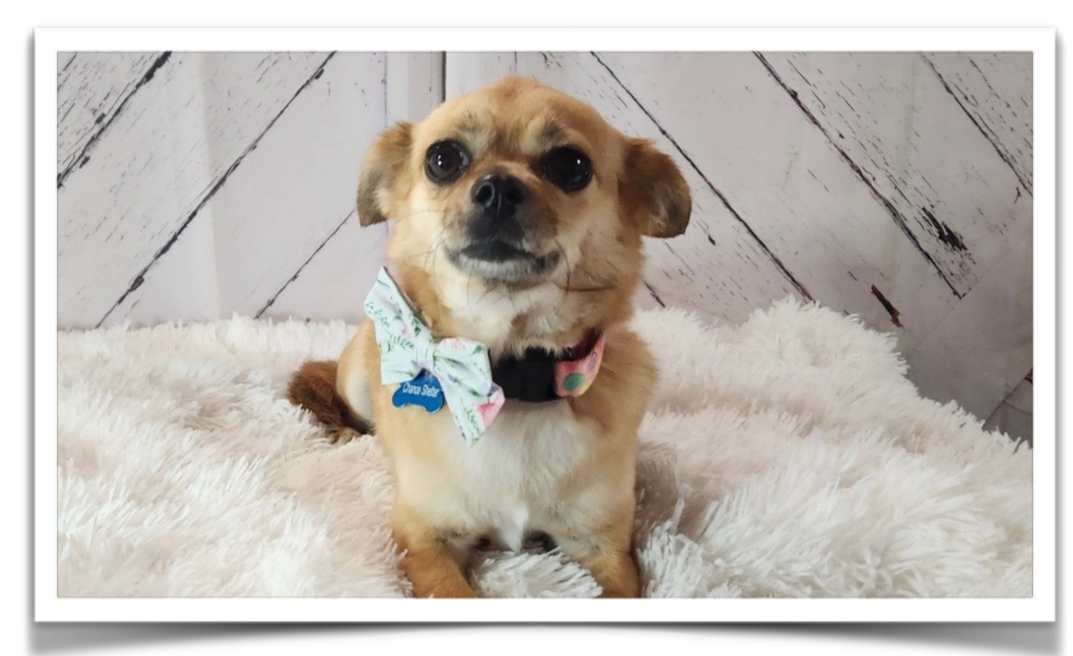
Our Mission is to provide compassionate care to animals through adoptions, crisis intervention, and community involvement.

In reflection of this impactful year, our unwavering commitment to community well-being and animal welfare has manifested in a series of significant achievements. By fortifying our community outreach partnerships, we've not only sharpened our ability to assess the specific needs of incoming referrals but have also streamlined the process of placing pets in crisis situations. Additionally, the remarkable contribution of our volunteers, totaling over 6000 hours, has been pivotal in orchestrating successful tasks aligned with our mission. As we celebrate these accomplishments, we look forward to building upon this foundation in the pursuit of our ongoing commitment to creating a brighter future for pets and their human companions.